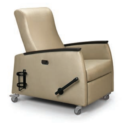
1857-L: Shown w/ Oxygen Tank Holder, and Urethane Arm Caps