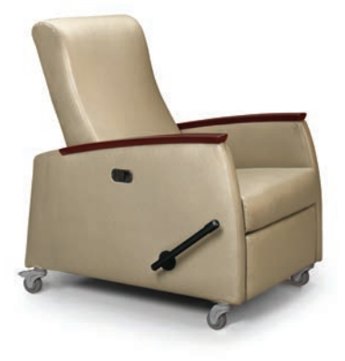
1857-L: Shown w/ Optional Wood Arm Caps