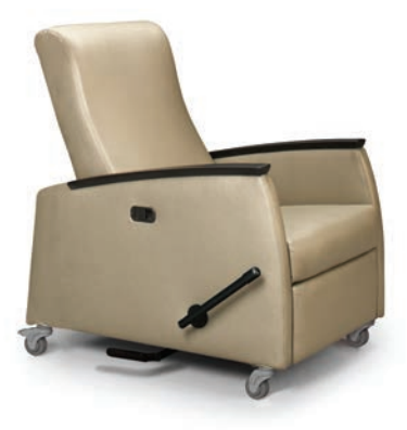
1857-T: Trendelenburg Model w/ Urethane Arm Caps