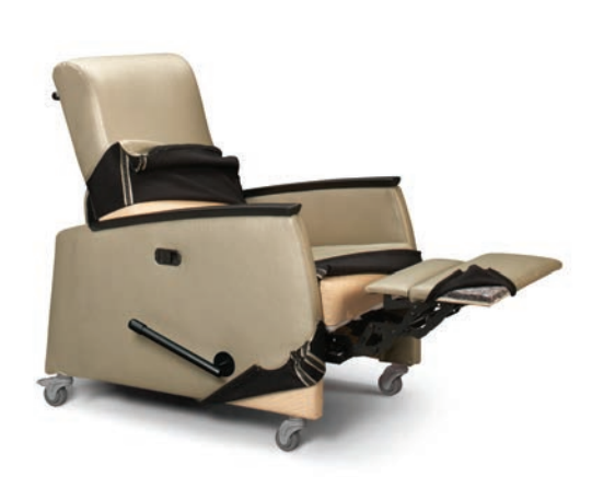
1857-L: Standard Removable Covers