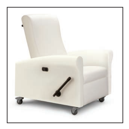
Revival 1813-L/T/X Models