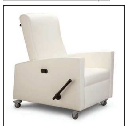
Replay 1513-L/T/X Models