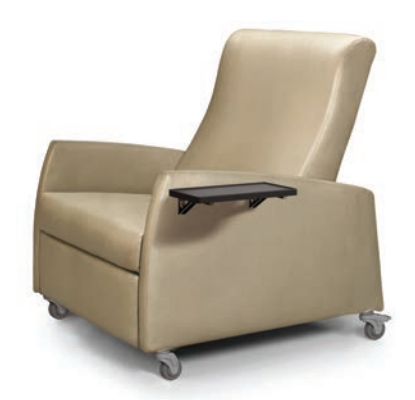
1857-XL: Bariatric Model w/ Optional Side Tray