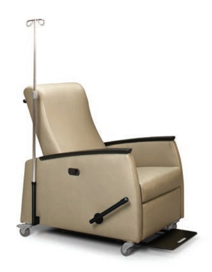
1857-L: Shown w/ Optional IV Pole, Foot Rest, Push Bar, and Urethane Arm Caps