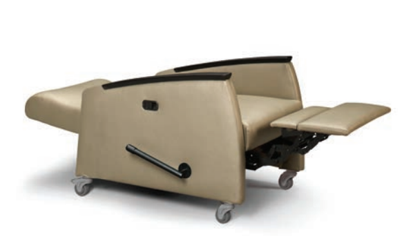
1857-L: Shown in Layflat Position